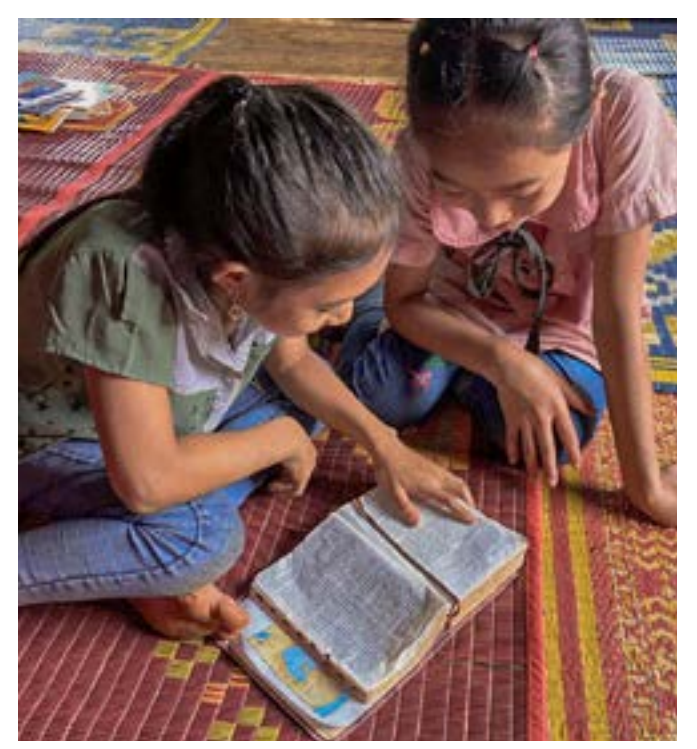
Girls reading the Bible in Laos.