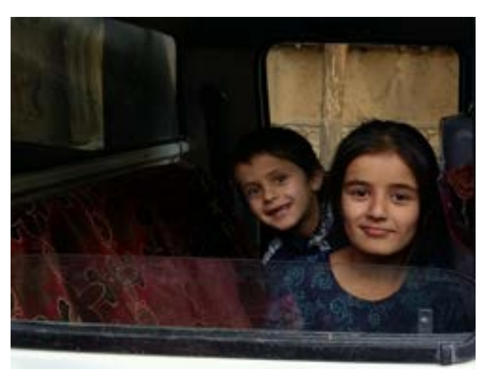
A young boy and girl in Afghanistan.

When analyzing the top 10 Pressure Points for 2021, three words synthesize the characteristic challenges