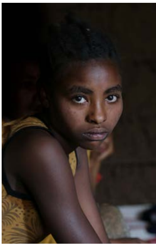
Eldest daughter of widowed and destitute Christian mother, southern Ethiopia.

Government armies, militias and criminal groups exploit Christian children and youth in conflict zones as commodities. They are shaped into child soldiers (see page 10: Gender and CSRP-YSRP), or bought and sold as products trafficked for