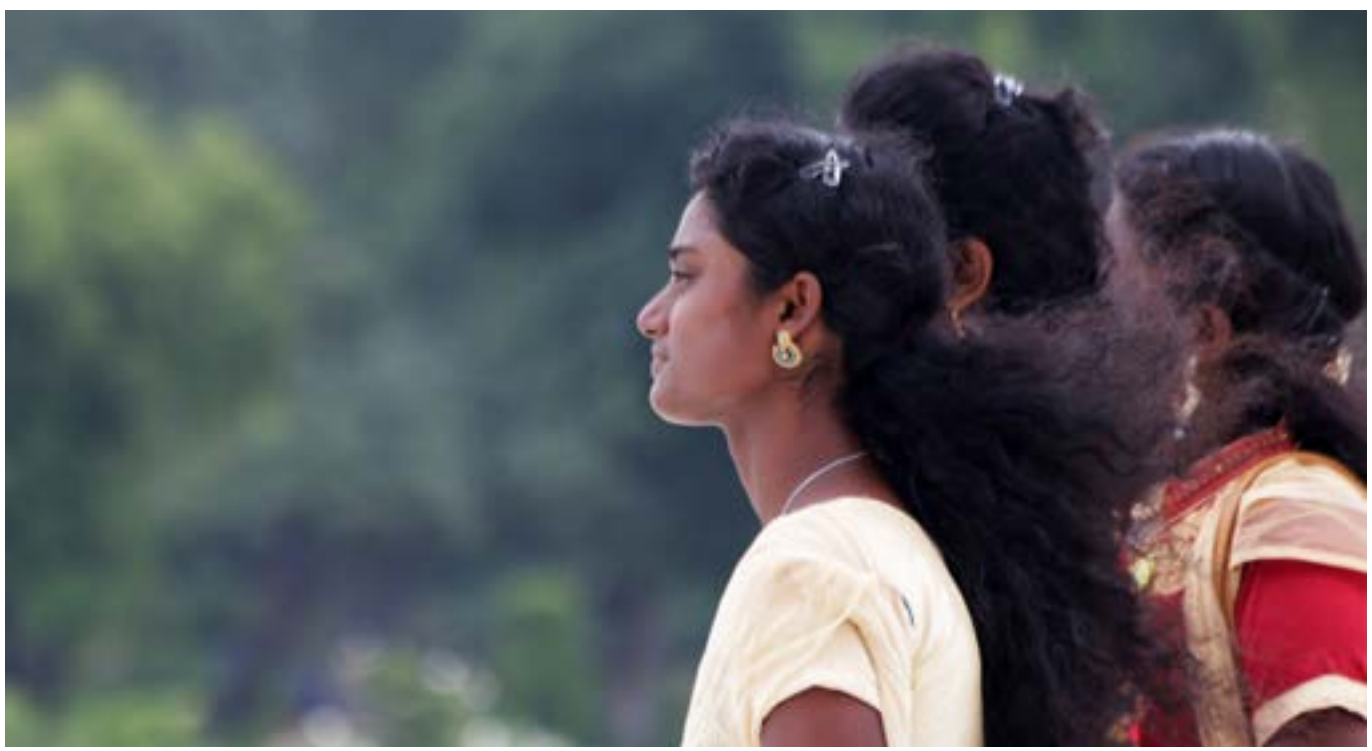
Teenage girls in Northern India.

As seen in Chart 2, Forced marriage and Violence - sexual were the two most widely reported Pressure Points for girls across the WWL 2021 top 50 countries. Affiliated Pressure Points such as Abduction, Trafficking and Targeted seduction also contribute to a pattern of targeting girls for their sexual purity and marriageability. Girls are usually fully dependent on family for financial and physical security and thus highly vulnerable should persecution come from within their family unit; escape is rarely an option.