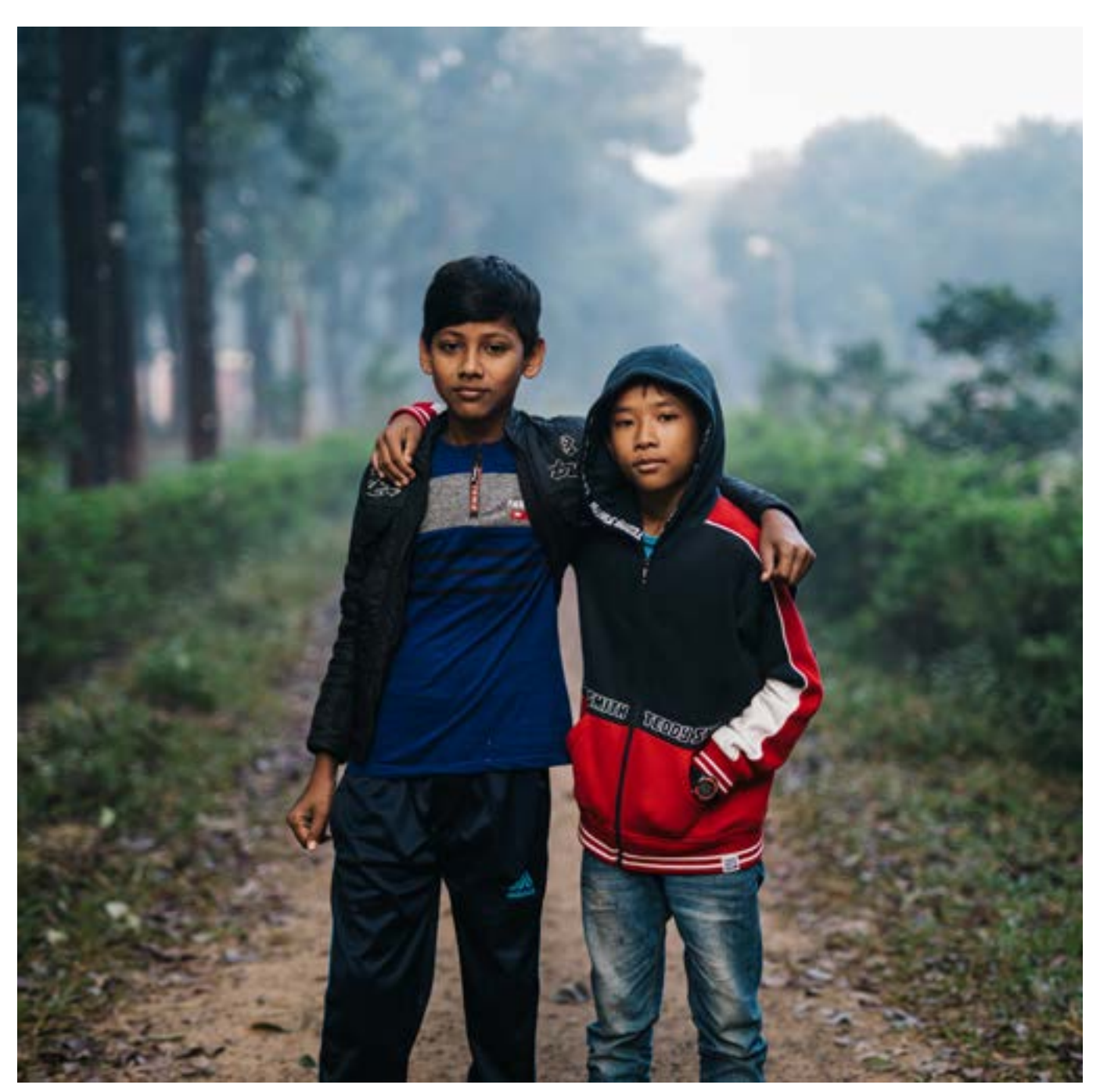
\label{lem:christian} \mbox{Christian boys of Muslim background in Bangladesh.}

in many countries where Christians are persecuted, with persecuting actors ranging from family members to peers to violent groups. Generally, this is motivated by those of majority religions or ideologies aiming to pressurize conversion, either to put pressure on relations, or using violence as a response to the rejection of the majority religion or belief. Yet sometimes there are specific triggers for violence, as in parts of Syria and Egypt, where witnesses reported that perceived immorality in the way Christian girls dress results in physical abuse. More commonly, the trigger is the refusal to renounce their faith or participate in the activities of violent groups.