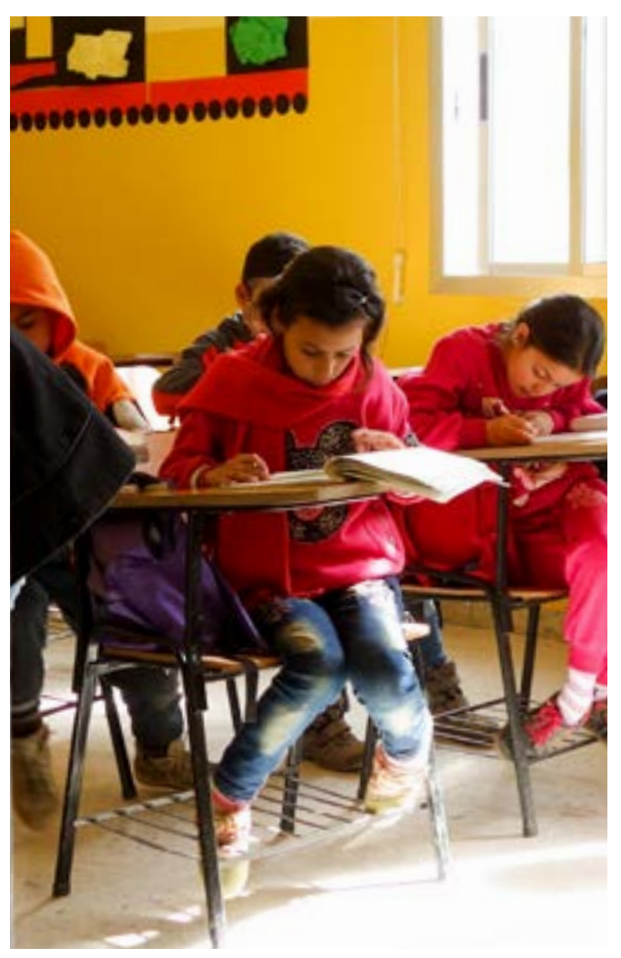
Class with Syrian children.

Four of the associated Pressure Points comprise different forms of violence (verbal, sexual, physical, and psychological) in addition to the discrimination inherent in Denied access to social community/ networks (children and youth shunned by classmates). Education has the power and potential to create cultures of tolerance and understanding, but equally, can "fuel stereotyping, animosity" and "entrench disadvantage". Carried out primarily by peers and teachers, an enabling environment often ignores, or worse, actively encourages such activities. Harassment of Christians may be seen as legitimate or even unremarkable, and so, these Pressure Points can be carried out with relative impunity.