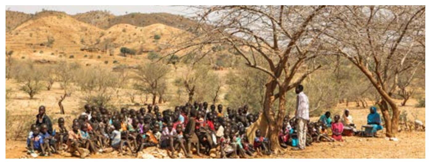
A class of students in Sudan.

a parent's Christian conversion, courts may automatically take away custody of children based solely on a parent's faith. Alternatively, extended families remove children from Christian parents, a practice accepted by communities due to embedded social norms. tates can exert further power over Christian parents: similar to the administration challenges churches face in the region, Christian parents with an Islamic background can often struggle to register children.<sup>21</sup> Chart 1 shows this in the high percentages for Denied access to a Christian parent and Denied legal identity as a Christian.