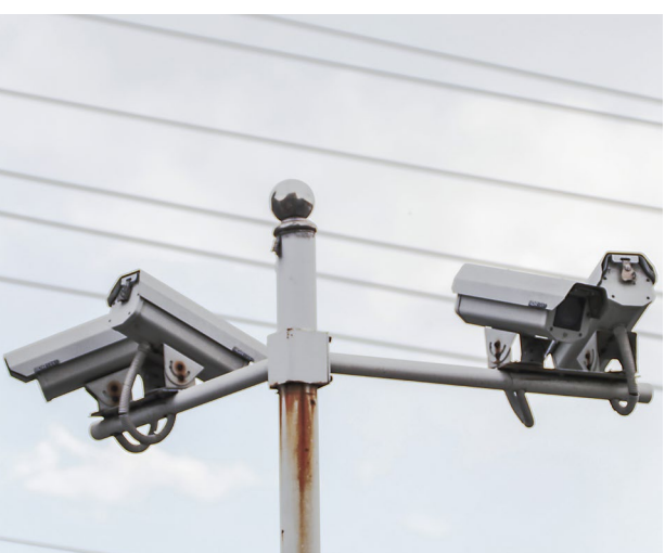
Cameras monitoring public life. City of Yanji, capital of the Autonomous Korean Prefecture Yanbian, China

Surveillance can also go hand in hand with censorship. First, it may prompt self-censorship, as targets of surveillance adapt to the assumption that they are being watched. After all, digital surveillance aims to achieve a panoptic effect, where the assumption of surveillance leads to changes in behaviour. Secondly, surveillance on technology platforms may lead to censorship on those platforms. For example, there are reports that online worship services in China have been shut down on Tencent Meeting (a video conferencing platform), due to the frequent mention of 'Christ'. Thirdly, more systematically, surveillance may form part of a social credit system, as data on individuals is used to give each citizen a score.<sup>16</sup>